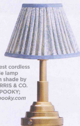
Ernest cordless table lamp with shade by MORRIS & CO. for POOKY; us.pooky.com