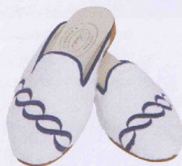
Treccia mules by PRATESI for STUBBS & WOOTTON; pratesi.com